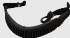
Top Carry Handle