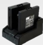
Dual-Bay Battery Charger